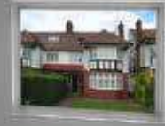
A2 Pocket (Landscape)