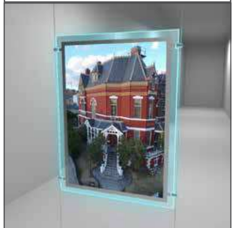
A2 Pocket (Portrait)