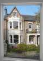
A1 Pocket (Portrait)