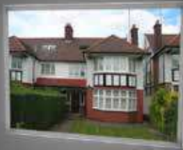
A0 Pocket (Landscape)