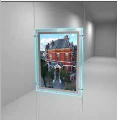
A3 Pocket (Portrait)