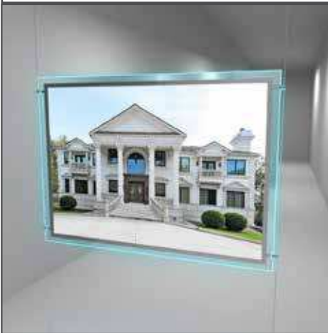
A1 Pocket (Landscape)