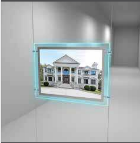
A3 Pocket (Landscape)