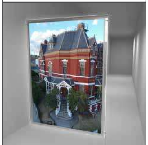
A0 Pocket (Portrait)