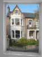
A2 Pocket (Portrait)