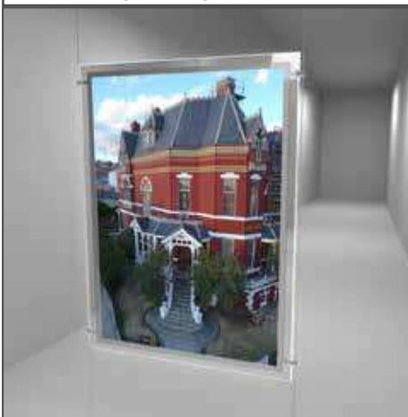
A1 Pocket (Portrait)