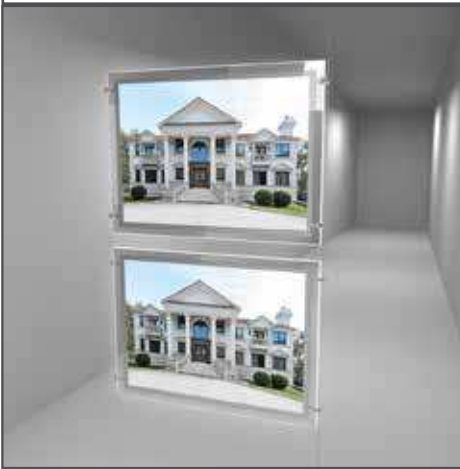
A2 Pocket (Landscape)