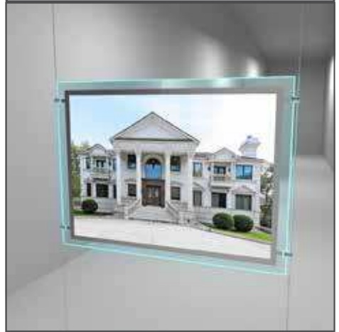
A2 Pocket (Landscape)