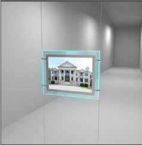
A4 Pocket (Landscape)