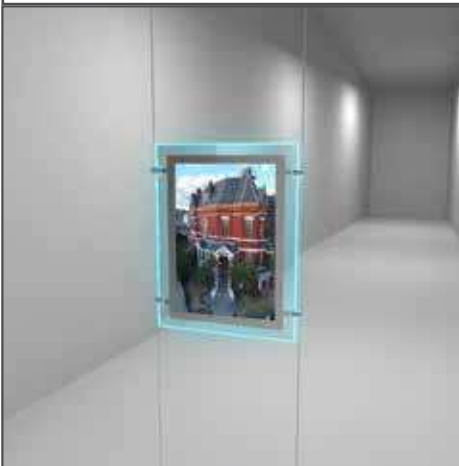
A4 Pocket (Portrait)