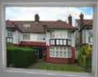
A1 Pocket (Landscape)