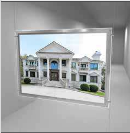
A1 Pocket (Landscape)