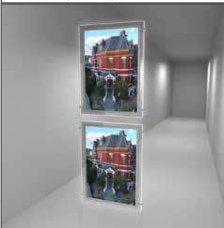
A2 Pocket (Portrait)