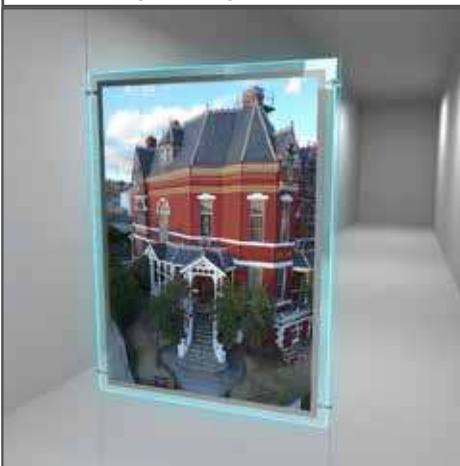
A1 Pocket (Portrait)