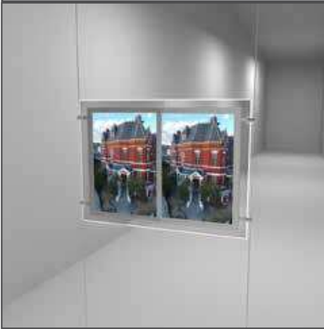
Single Pocket LA4P2W-V5

Overall size 503x380mm to fit cable centres 512mm