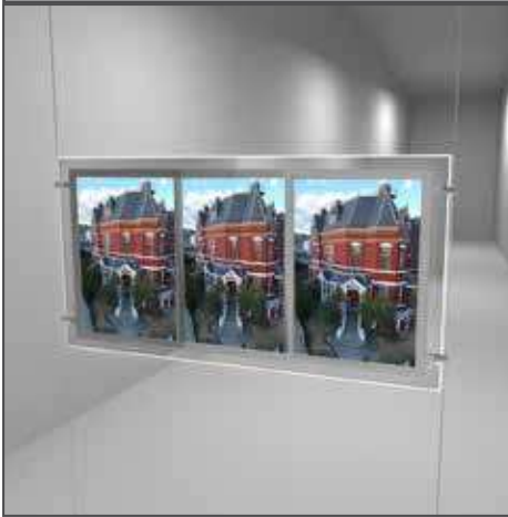
Single Pocket LA4P3W-V5

Overall size 730x380mm to fit cable centres 739mm