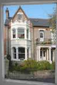
A0 Pocket (Portrait)