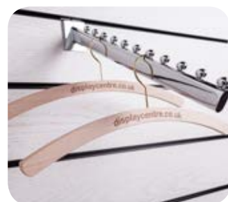
A Variety of Clothing Arms