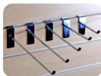
Prongs For Slatwall