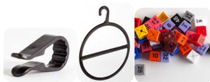
Size Cubes & Accessory Hangers

Our own brand hanger grips are called GraylinGrips. We developed them as a cost-effective way for retailers to be able to add grips to their hangers without having to replace their existing hangers. The super strong adhesive holds the grips in place, helping retailers keep their shops tidy as clothes are prevented from falling from hangers as customers browse