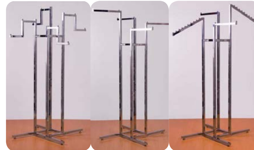
Feature Arm Rails

Our range of clothing displays includes a broad variety of hanging rails and feature rails. The large range ensures that charity retailers can find the items that they need with ease