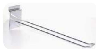
Slatwall Euro Arms