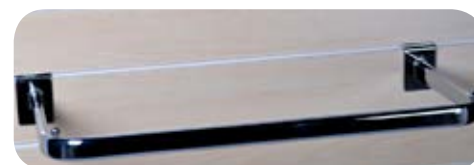
D-Rails & Clothes Arms For Slatwall