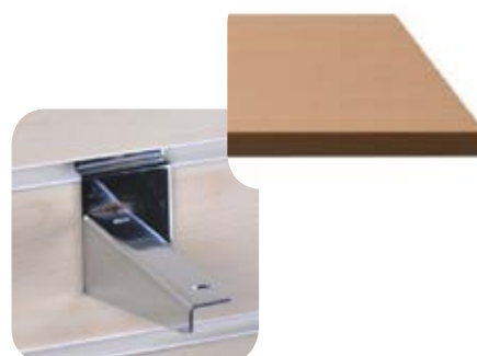
A Variety of Wooden Shelves